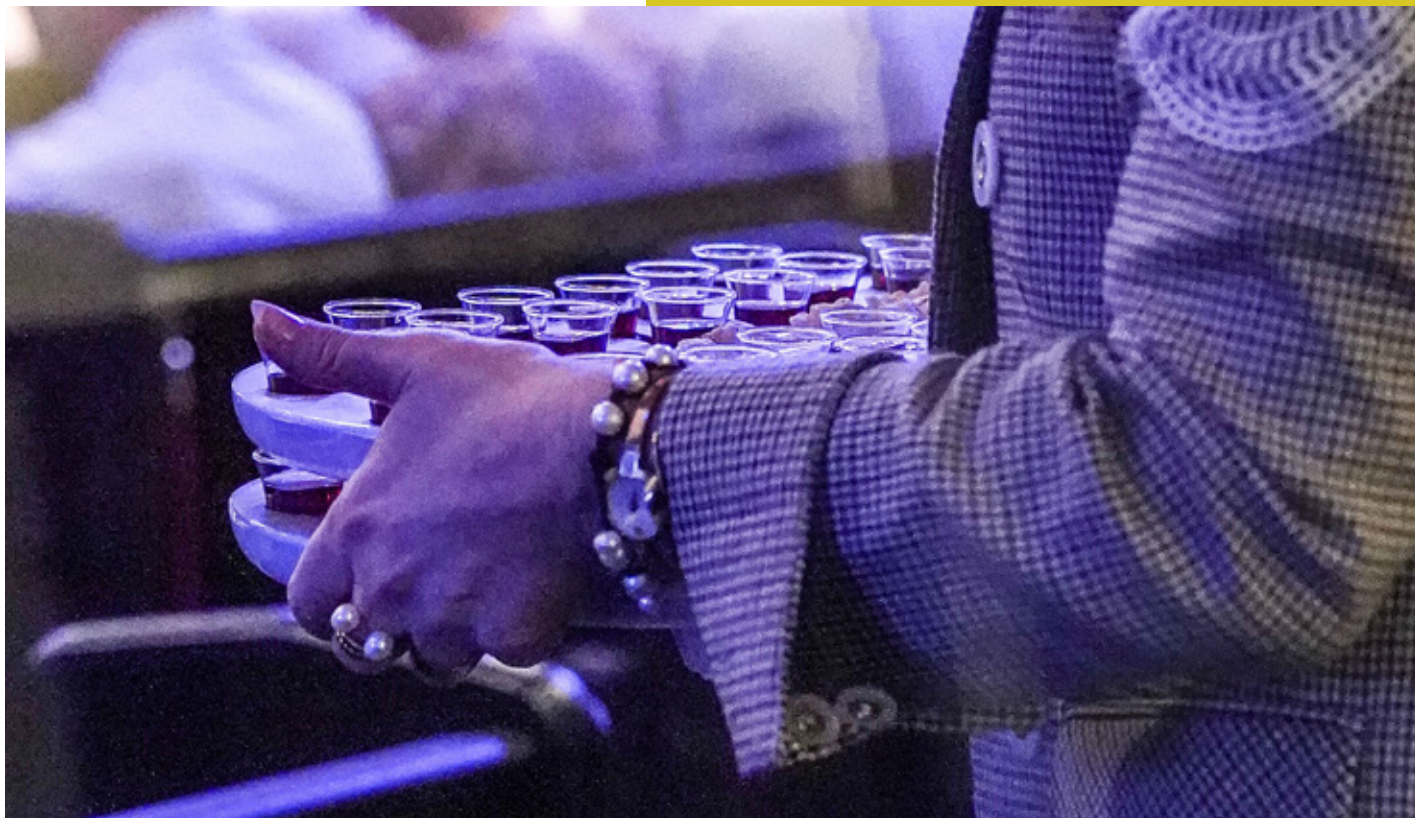
Communion is an integral part of our weekly worship - and volunteers both prepare every tray and help pass them through the pews